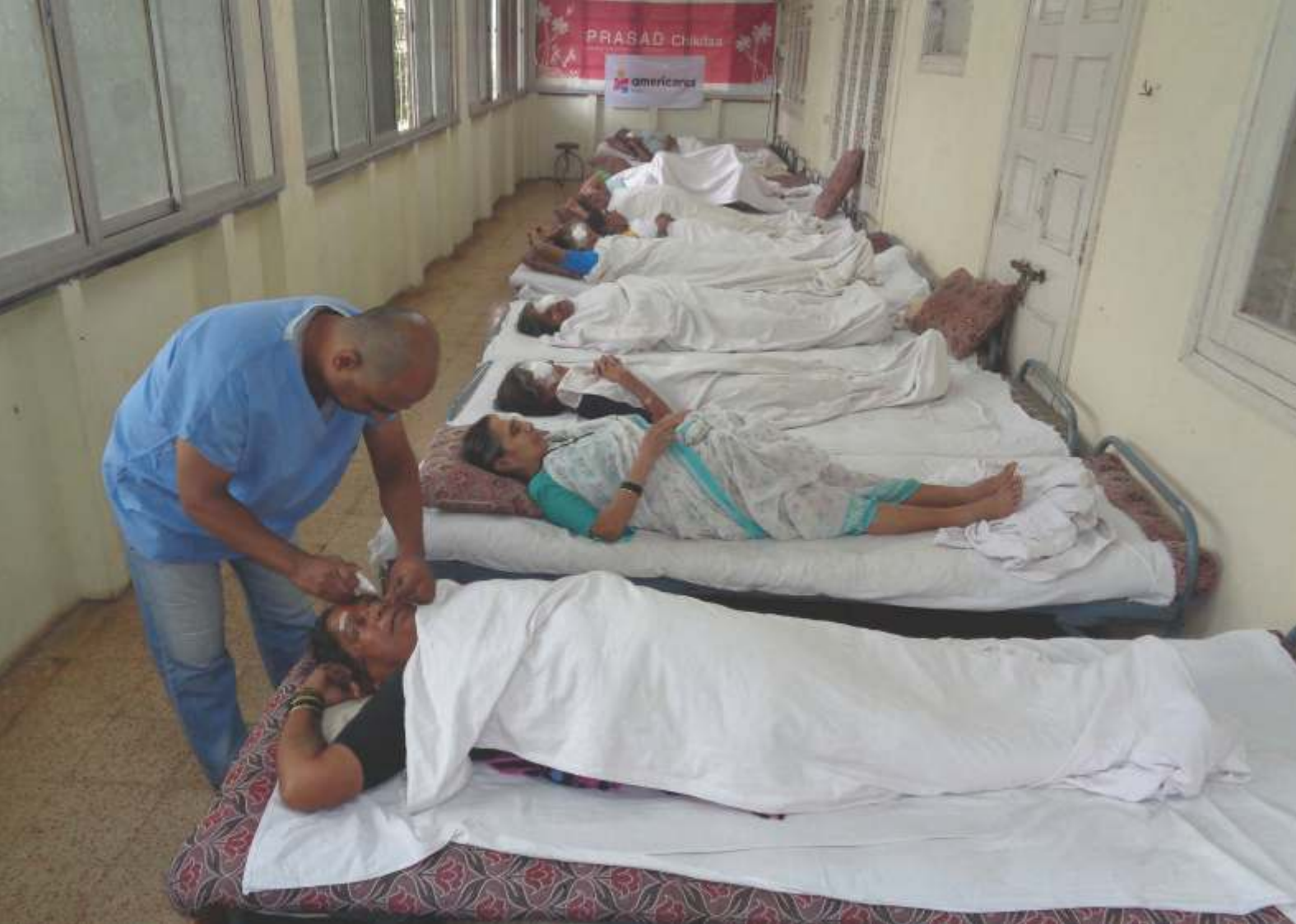
Americares partner Prasad Chikitsa utilizing donated medicines at their hospital in Ganeshpuri, Mumbai

Due to lack of access and affordability, individuals and families cannot get the medicine they need to stay healthy. As the leading non-profit provider of donated medicine and medical supplies, Americares India is working to change that.