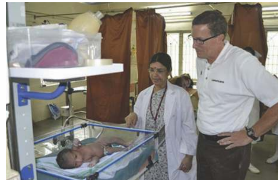
New born stabilization unit (NBSU) at Tambaram GH upgraded by Americares

After the unprecedented flooding in December 2015 in Tamil Nadu, Americares India upgraded 27 primary health centres, four general hospitals and the state-level rehabilitation centre. All facilities are open and providing quality care to families and individuals recovering from the floods.