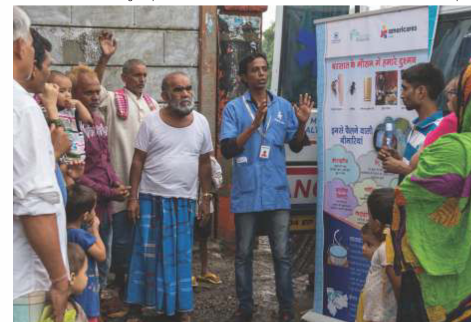
Health education and group awareness on vector borne diseases near our MHC camp

Each fully-equipped mobile health centre is staffed with a doctor, health worker, pharmacy assistant and data associate to provide complete care onsite. Beneficiaries receive health education on various prevailing health issues including communicable diseases, anaemia, diabetes and hypertension, among others. Electronic health records for all patients are maintained to facilitate follow-up treatment and monitor the program.