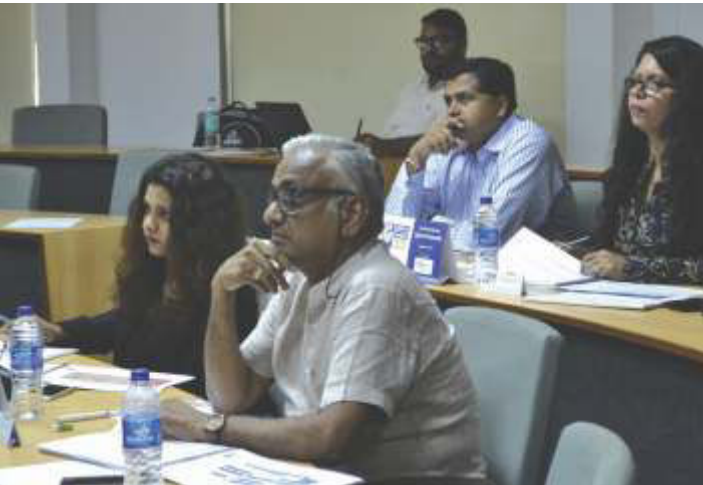
Pre-final jury round at SPJIMR, Mumbai

academia, social and CSR sectors unite at Spirit of Humanity for rendering their knowledge & expertise and evaluating the social impact created by participating organizations. Now in its 8 th year, the Spirit of Humanity will bring together various stakeholders for sustained engagement and cross learning.