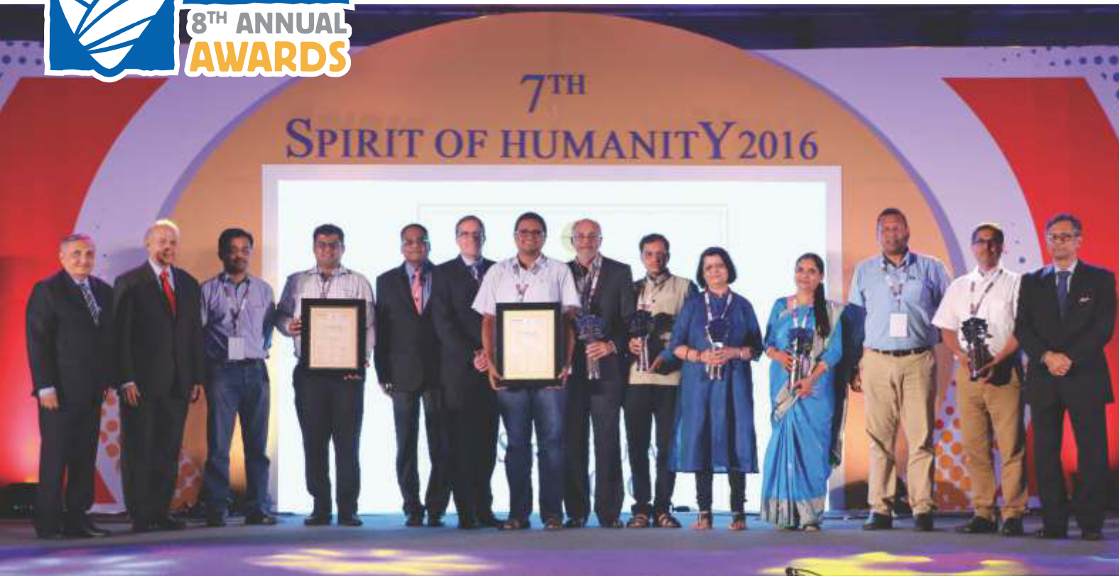
Winners of 7 th Spirit of Humanity Awards, September 2016

This is the philosophy which inspired the inception of Spirit of Humanity as a recognition and reward platform for exemplary contributions made towards the society. Over the years, Spirit of Humanity has expanded its scope to become a national-level platform for collaboration, capacity building, rewards and recognition within the social sector in India. Thought leaders from corporate, government,