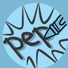
Strengthen PEP Mechanism