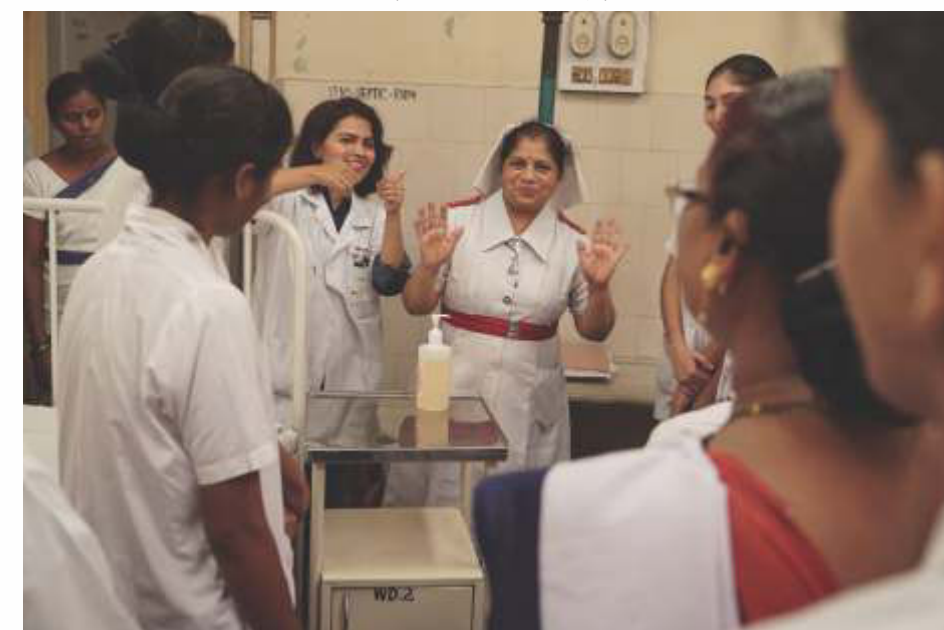
In-ward awareness session for Hospital staff on safety precautions

By collaborating with hospital management at every stage of the workforce safety program, Americares India ensures buy-in and sustainability. The hospital signs a joint memorandum and commits to taking over the program responsibly.