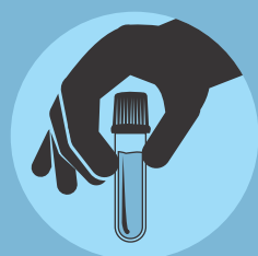
HCWs & Infection Surveillance

We protect health care workers at risk of occupational exposure to infections such as hepatitis, HIV and tuberculosis among others.