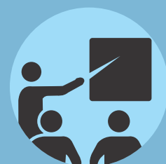
Training & Education