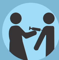
Immunization & Protection