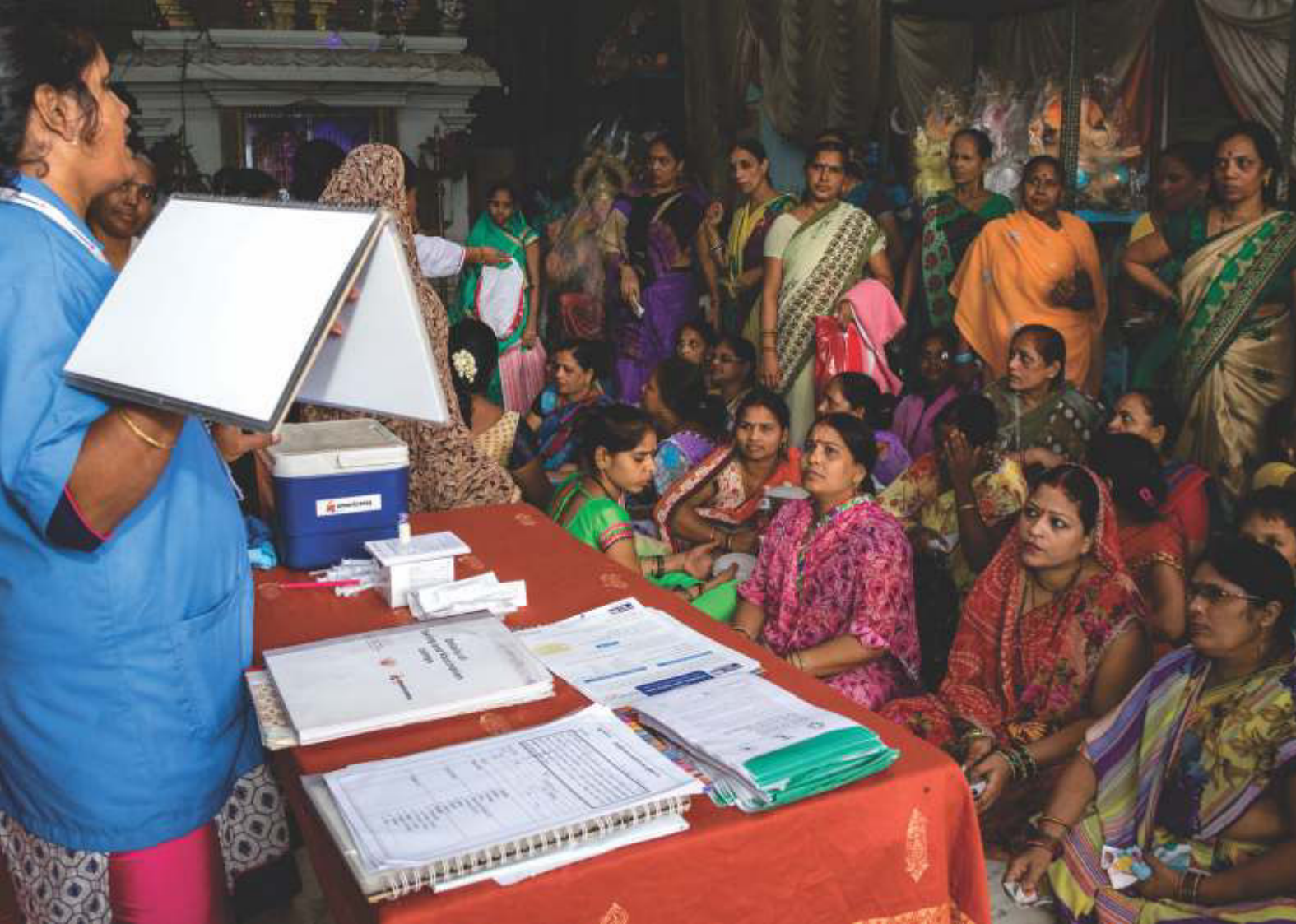
A group awareness session on Hep B in progress

We support, design and implement clinic-to-community programs in areas such as maternal, new-born and child health, mental health, hypertension and diabetes.