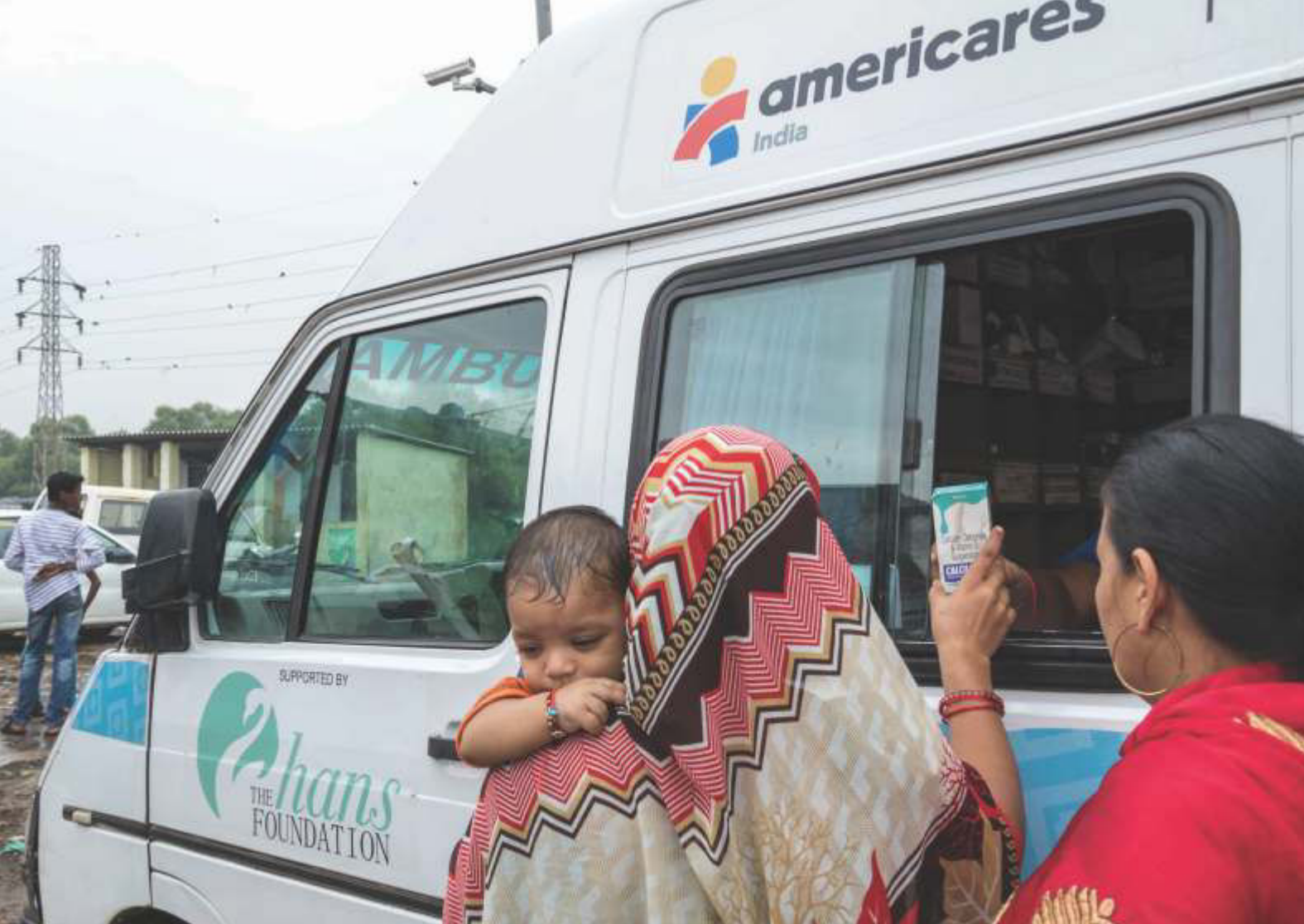
Beneficiaries receive free medicines at the Mobile Health Centre

Every person should have access to quality health care. Through our mobile health centres in urban slums, we offer patients treatment, prevention and health management services - the foundation of a productive life, full of opportunity and possibility.