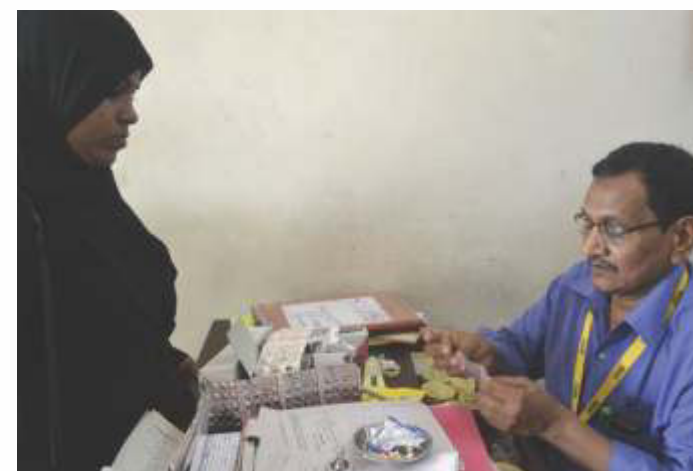
Patients at Americares partner clinic MESCO receive medicines