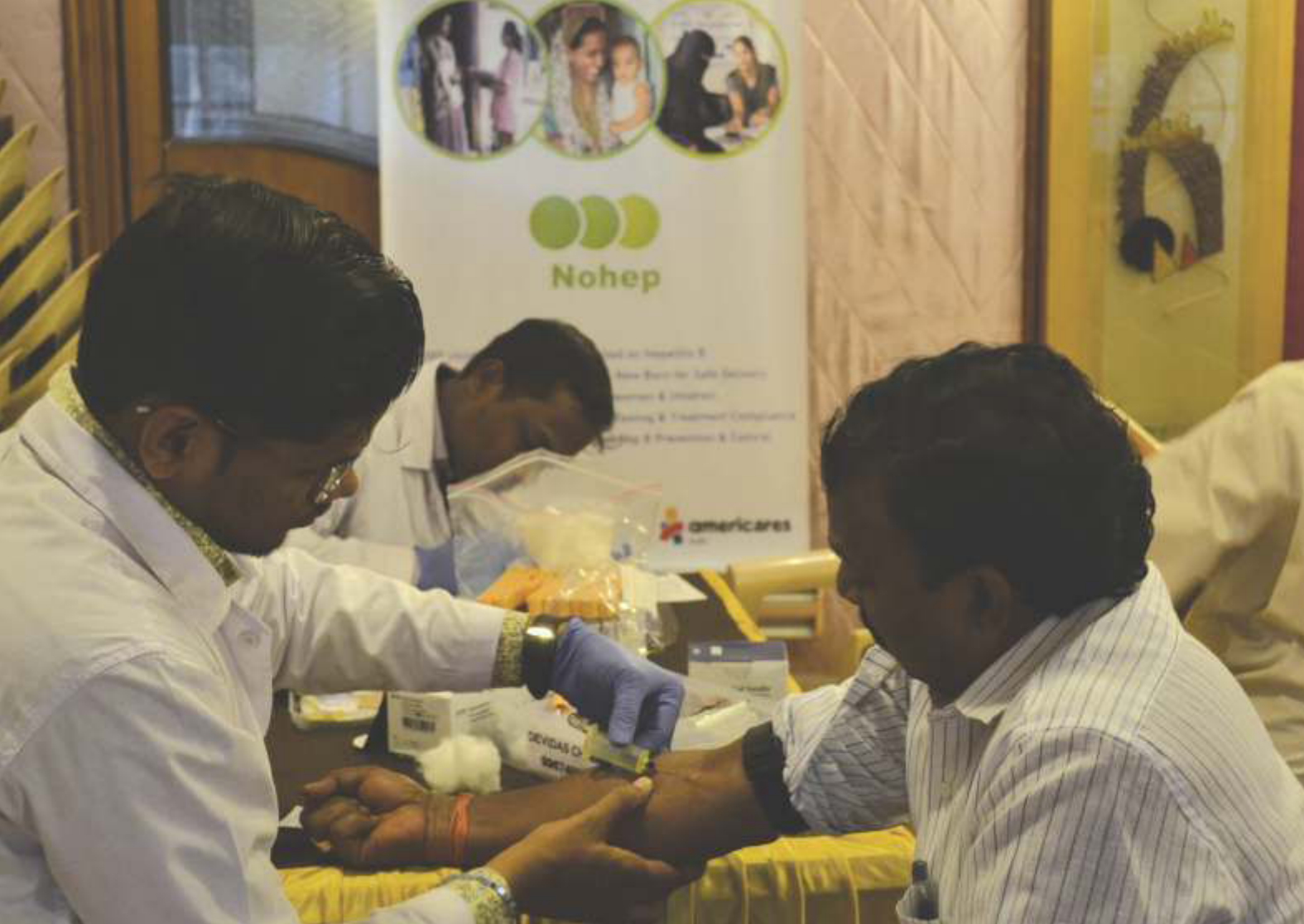
Vaccination camps protect Health workers against Hepatitis B

We protect health care workers at risk of occupational exposure to infections such as hepatitis, HIV and tuberculosis among others.